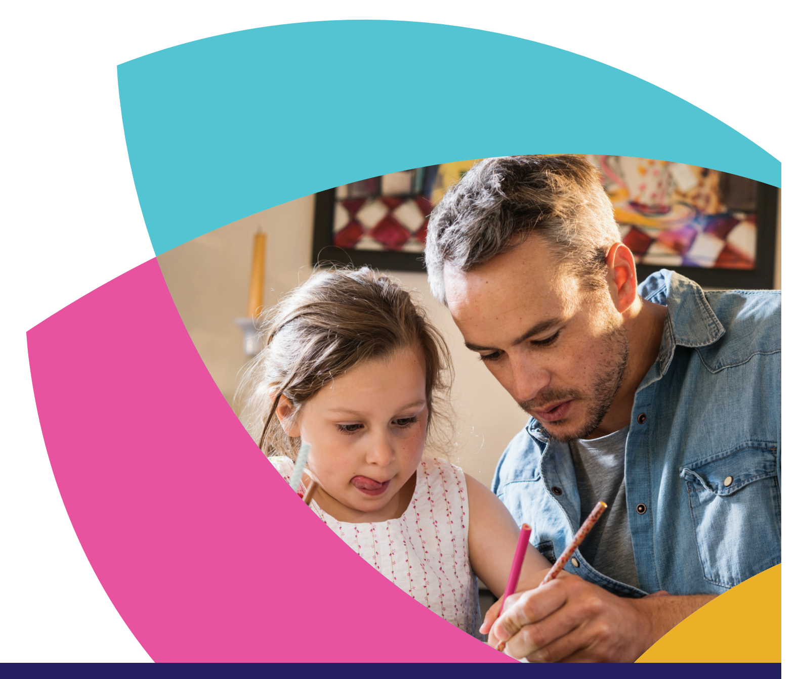
Keeping Fathers in Sight: Supplementary guide for schools and colleges | 5

Contact details for all parents should be shared by any organisation at times of admission or transition. Any gaps or omissions of contact details for all parents should be questioned and reviewed. Without comprehensive understanding of the child's family network, appreciating the child's lived experience is not possible.