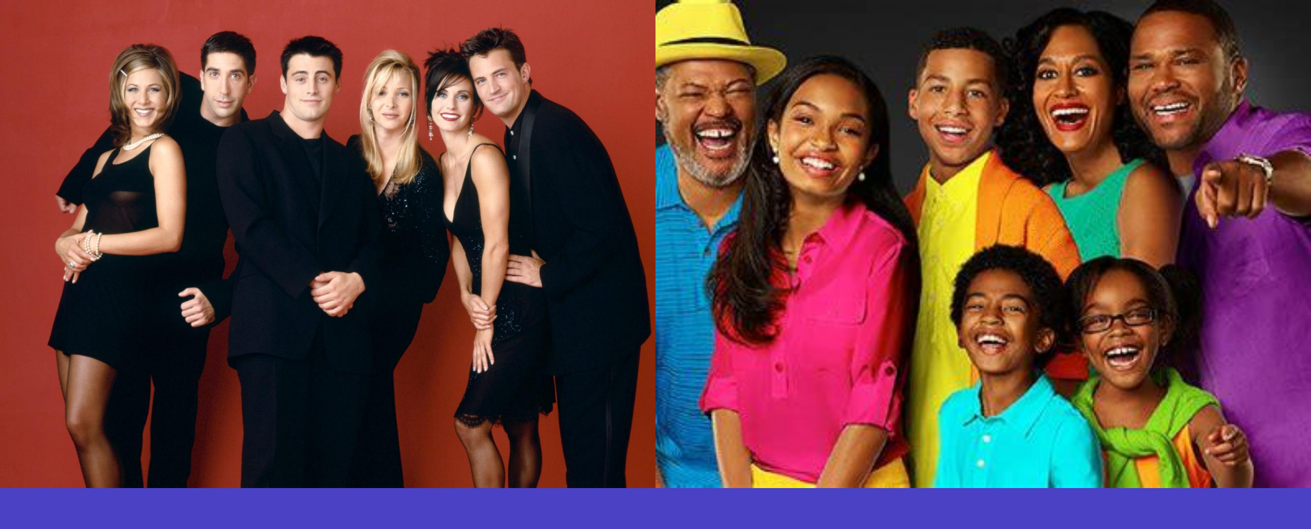
Relationships - what do you value?